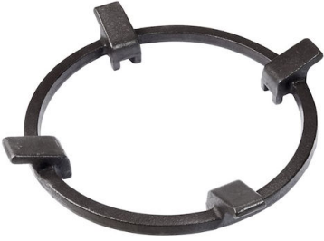
Cast iron wok support